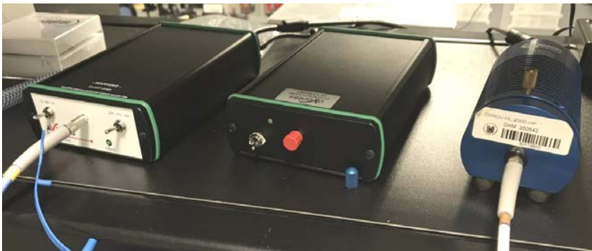
Figure 1: Left: combined halogen/deuterium source (left switch allows to select the combination); middle: UV diode (narrowband) source; right: high power halogen (VIS) source with manual intensity regulation (brass knob on the top)